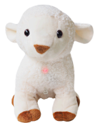
Talking soft toy Lamb & Tumi Tiger