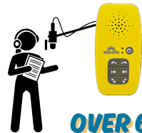
Kulumi players that charge via solar power.